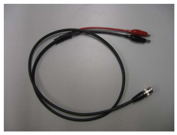
Figure 1 The top right image is the "alligator clip" end of the cable pictured above. The lower right image is the BNC cable end of the female type.

1. Use an "alligator clip" and a BNC (Bayonet Neill-Concelman) cable to connect the PROBE ADJUST signal to Channel 1 on your oscilloscope. The PROBE ADJUST is a small metal cylinder protruding from the bottom right of the oscilloscope.